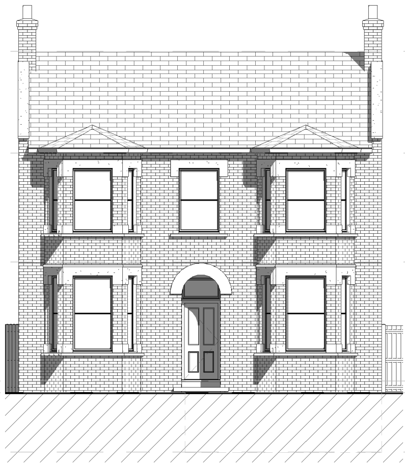
Existing Front Elevation. 1 : 100